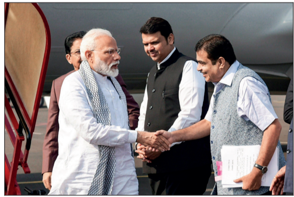
PM Modi was received in Nagpur on Saturday morning by Union minister Nitin Gadkari and CM Devendra Fadnavis

In Pandharkawda in Yavatmal district, the PM inaugurated schemes including an Eklavya residential school at Kinwat in Nanded, road works and irrigation projects, flagged off the Humsafar AC train between Ajni (Nagpur) and Pune through a video link and handed over symbolic keys to beneficiaries who have got houses under the PM Awas Yojana and certificate to women beneficiaries of several other schemes.