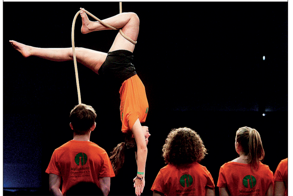
A foreigner does the Malkhamb at the first-ever international championship held in the city on Friday. Participants from more than 15 countries took part in the event