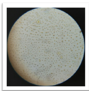
Figure 1: Photomicrograph of acriflavine transfersomes

The photomicrograph of optimized acriflavine transfersomes (Figure 1) is shown in figure. Photomicroscopic observation of the optimized transfersomal formulation after hydration with buffer revealed the formation of vesicular structure.