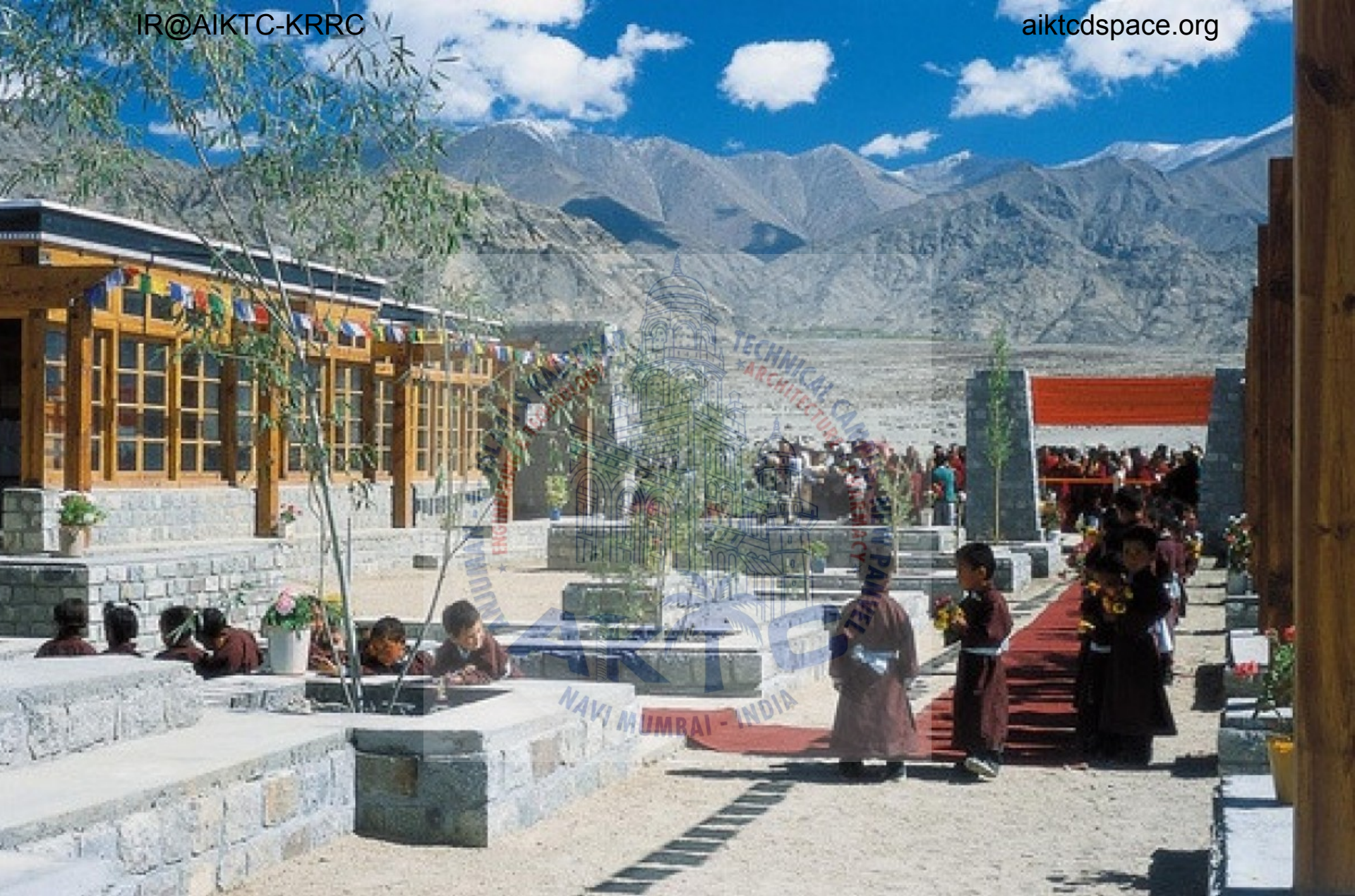
Druk School at Ladakh