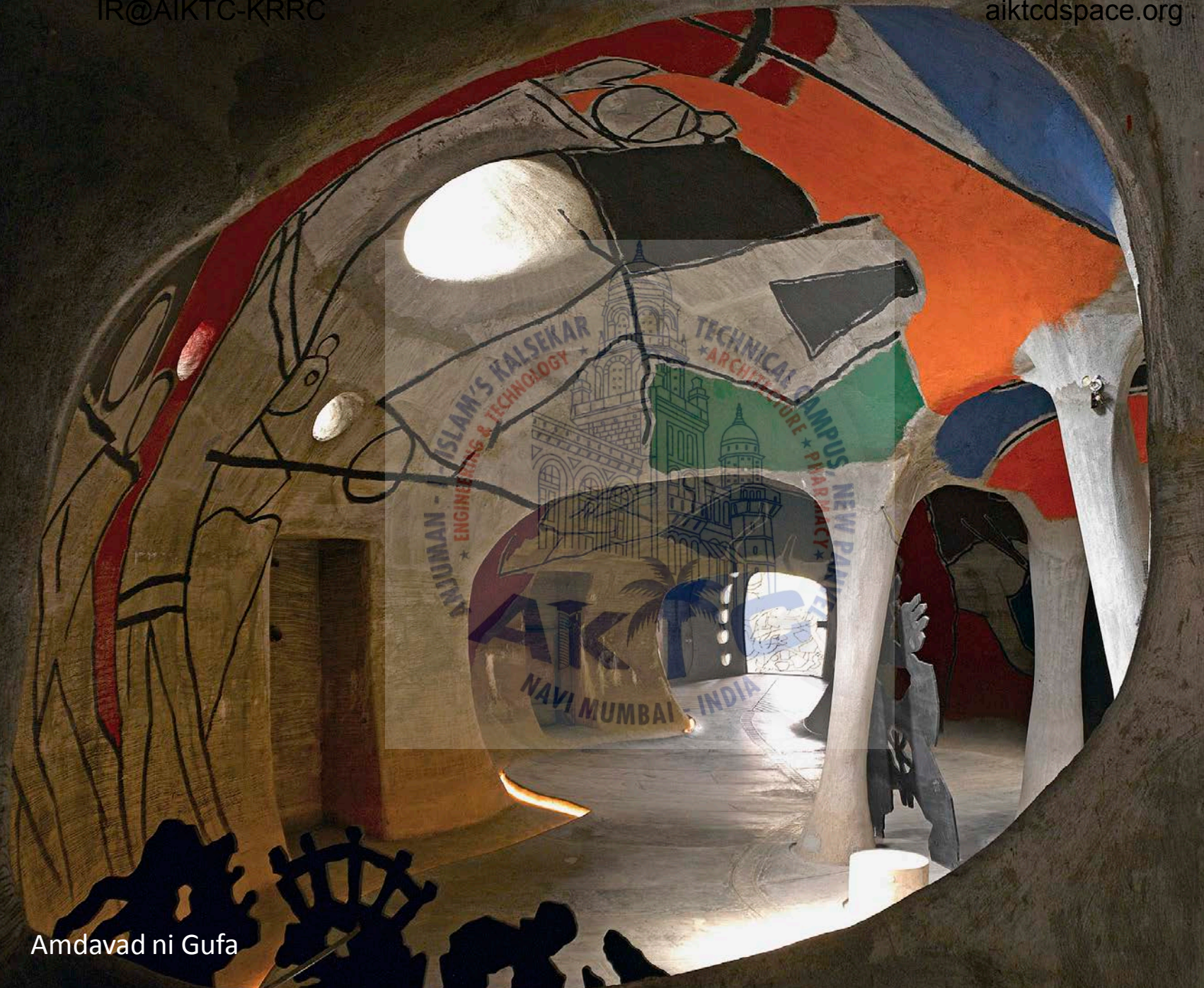
Amdavad ni Gufa