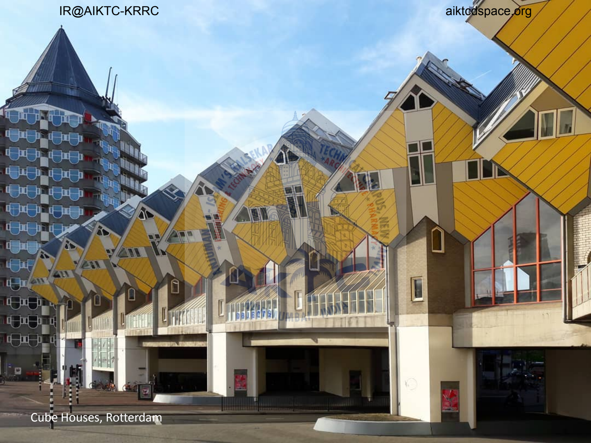
Cube Houses, Rotterdam