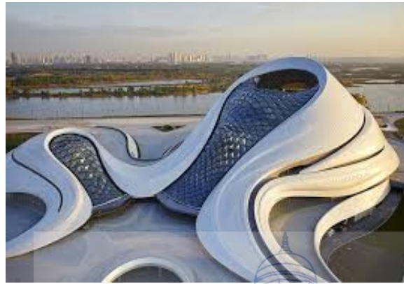
Zaha Hadid Projects